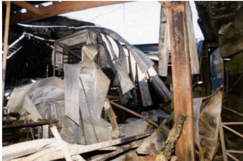
The damage caused by the fire in the area of the muffin-proving room.

Comment: It has been reported that polenta flour gets trapped in the associated machinery during the muffin production process. It recirculates within the system forming a film of residue on the inside of the machinery and the exhaust ducting leading to the roof area. This would have contributed to the risk, and the subsequent spread, of fire.