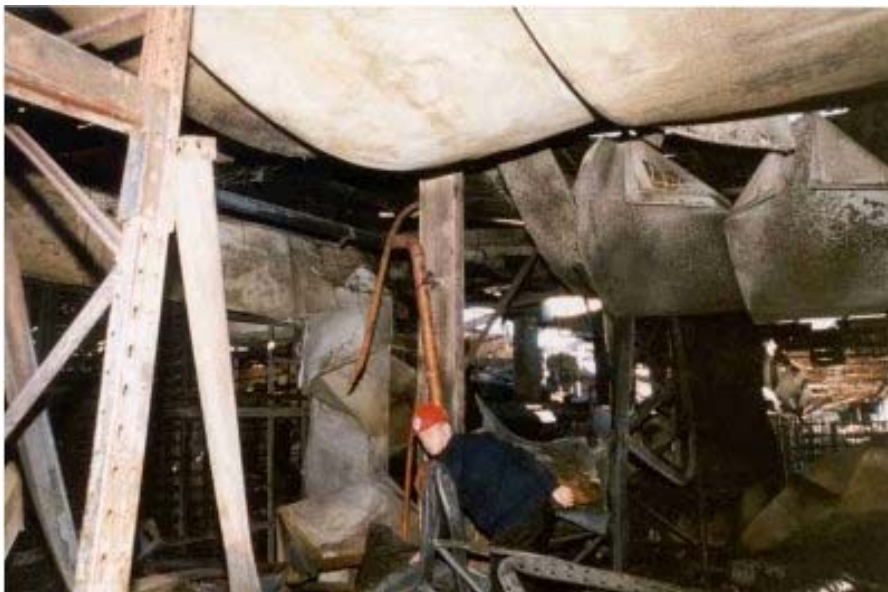
An Officer from the NSWFB Fire Safety Division examining the fractured internal fire main at the north east corner of the factory.

Water was obtained utilising a closed relay from Court St and from pillar hydrants from an adjoining industrial complex on the southern side at 303 The Horsley Drive.