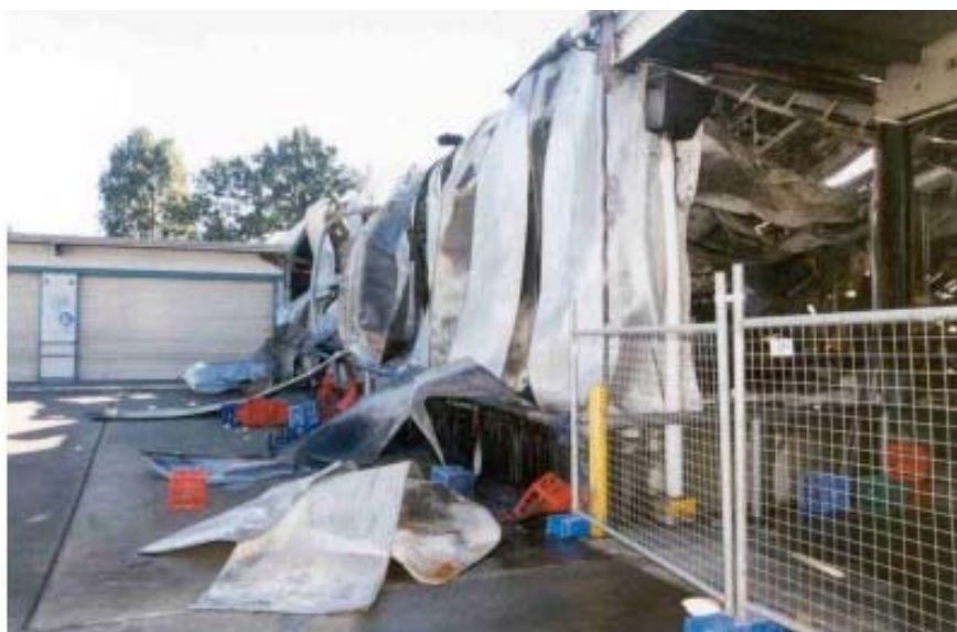
These heat affected insulated sandwich panels were located at the front of the factory. Note the absence of the foam cores.

Firefighters need to be aware of the inherent dangers of this type of lightweight construction. Incident commanders must be aware that firefighting in these conditions can be extremely hazardous with early collapse, high fire load and massive smoke production being major factors affecting firefighter safety.